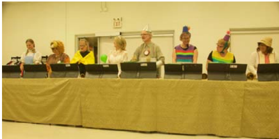
The Bells of Westminster