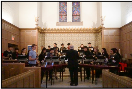
The Johnson Ringers, TCS, in the Memorial Chapel in October, 2018, our first-ever Halloween-themed concert.