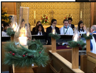
'Carol of the Bells'.