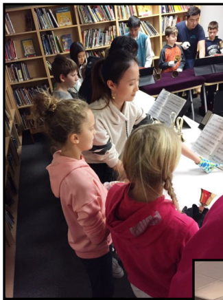
Photos from the annual Week Without Walls event at TCS - our Me-To-We phenomenon for the whole school, when students head out to all sorts of sites.

Eleven senior ringers spent three wonderful days at St Joseph's Separate School, Bowmanville, teaching ringing to 230+ children from Grades