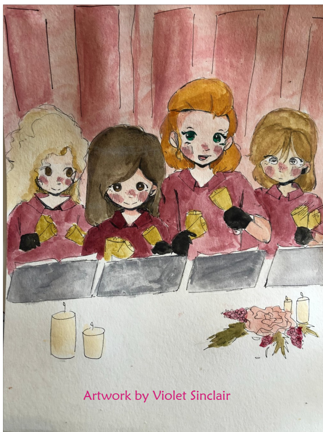
Artwork by Violet Sinclair

We are looking for some handbell themed art and we would like to see what our members have to offer.