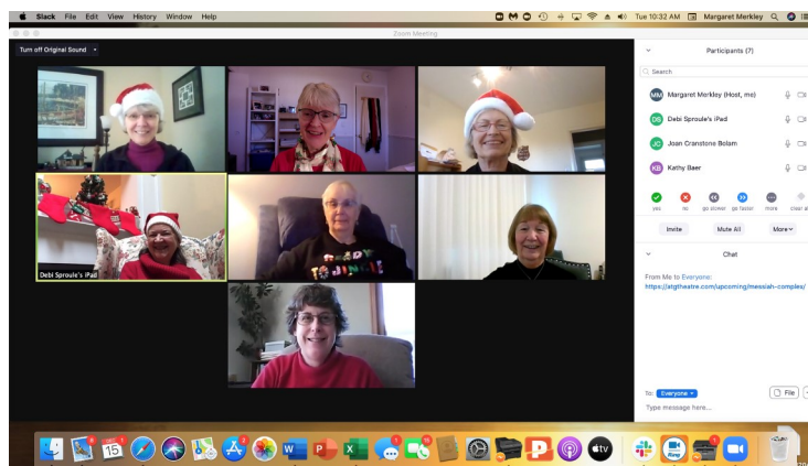
December Bell Social

Another way to keep connected with your bell friends is by joining our monthly bell socials that take place virtually by Zoom. They are advertised both on the OGEHR website and through the email tree.